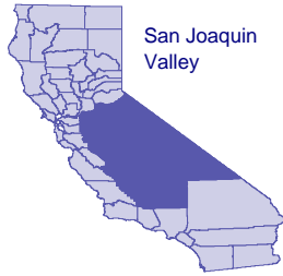
San Joaquin Valley