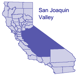
San Joaquin Valley