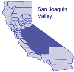
San Joaquin Valley